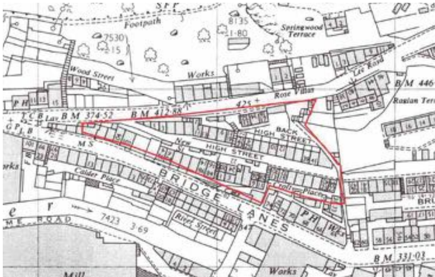
1961 map showing houses at High Street and Bridge Lanes