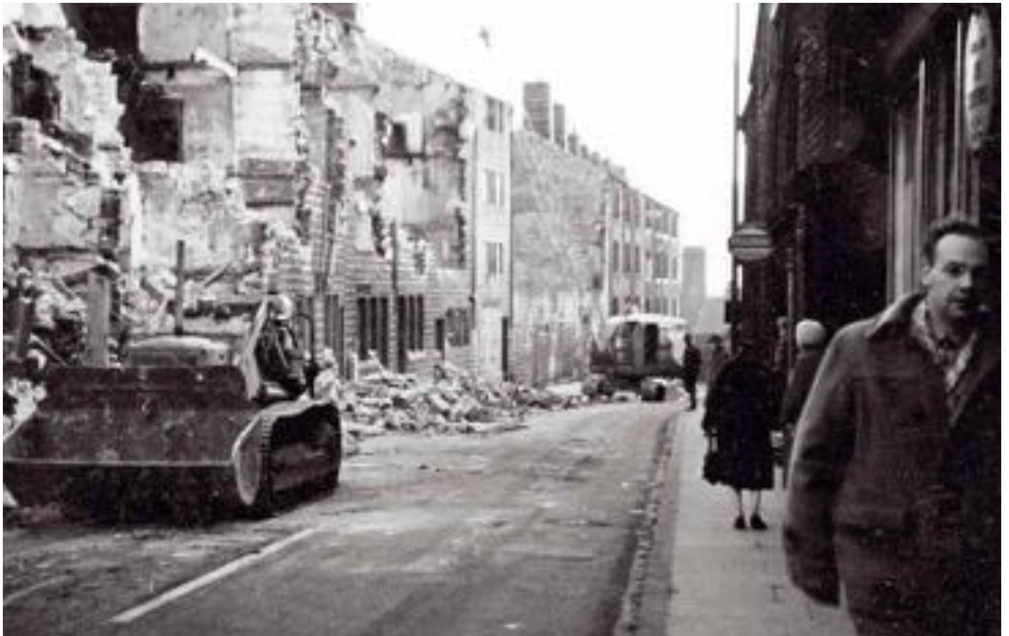
Houses on the north side of Bridge Lanes being demolished in April 1964.