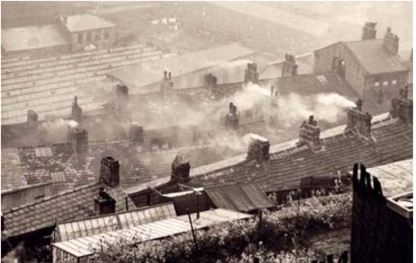
Looking over the roof tops of High Street.