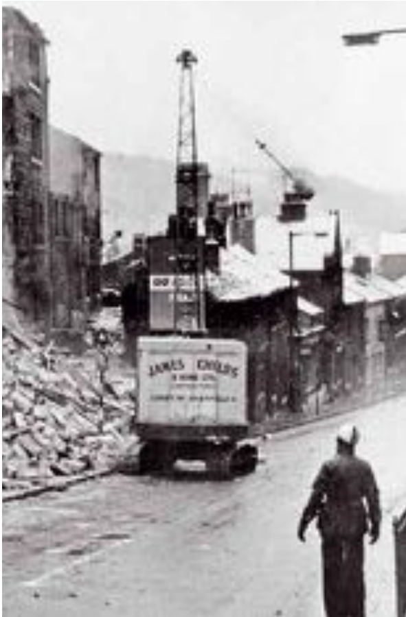
Demolition of Croft Place, 1963