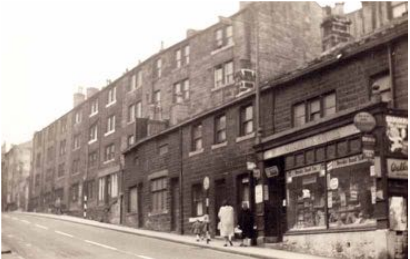
The north side of Bridge Lanes.