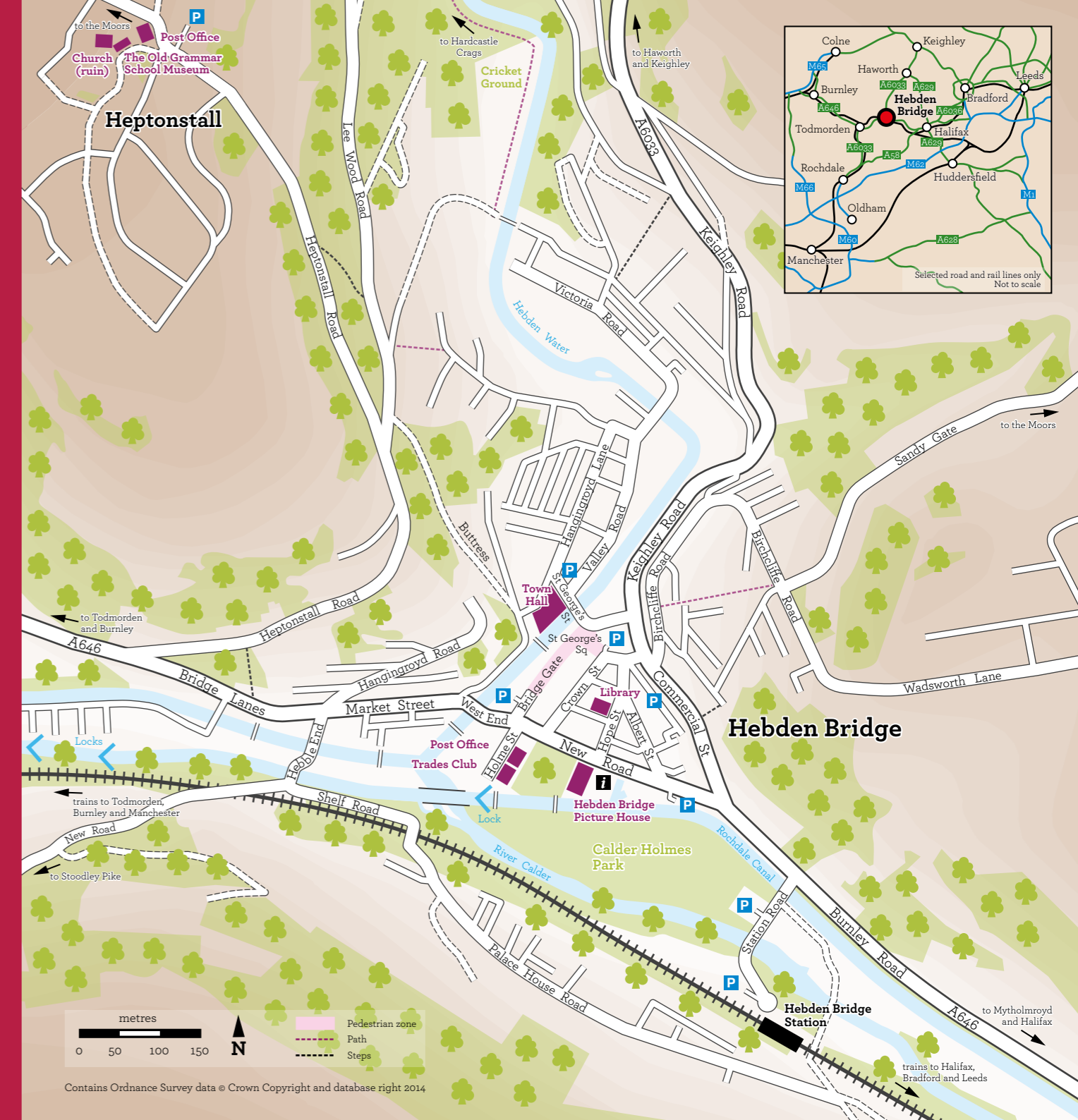
Hebden Bridge Picture House

Contains Ordnance Survey data © Crown Copyright and database right 2014