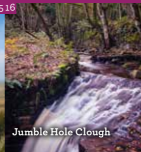
Jumble Hole Clough