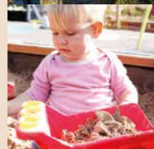
Plenty of Playgrounds