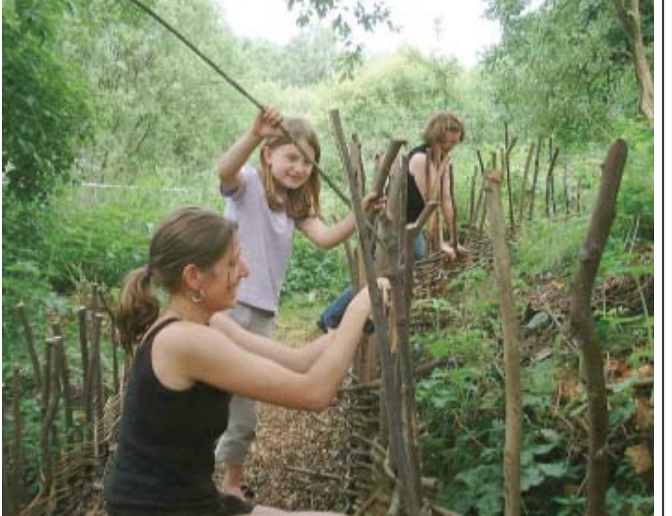
A willow weaving and dry stone walling workshop was held recently in Primrose Garden (across the canal from the ATC) run by Helen Blackwell and Bill Rofe. Work continues to complete the project. If you would like to be involved, contact Susy Feltham at the ATC.

The views expressed by individuals on the Green Page do not necessarily represent the views of the ATC.